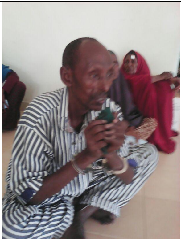
A prisoner with cataract blindness waiting his turn for sight restorative surgery