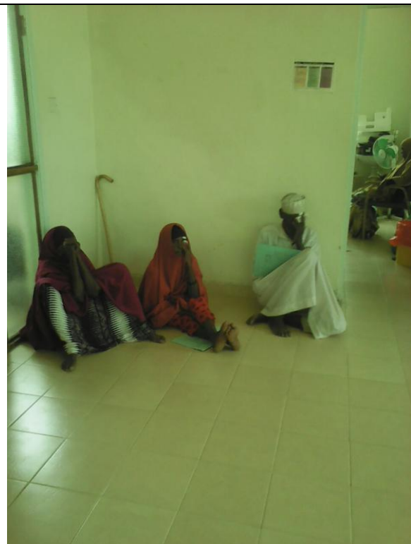
Waiting for post-operative follow up second day after surgery.