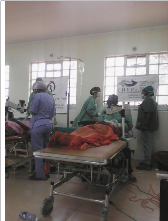
Two surgeons operating at same time