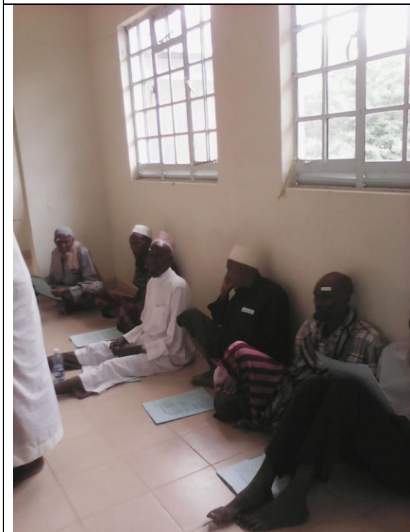
Awaiting their turn for surgery