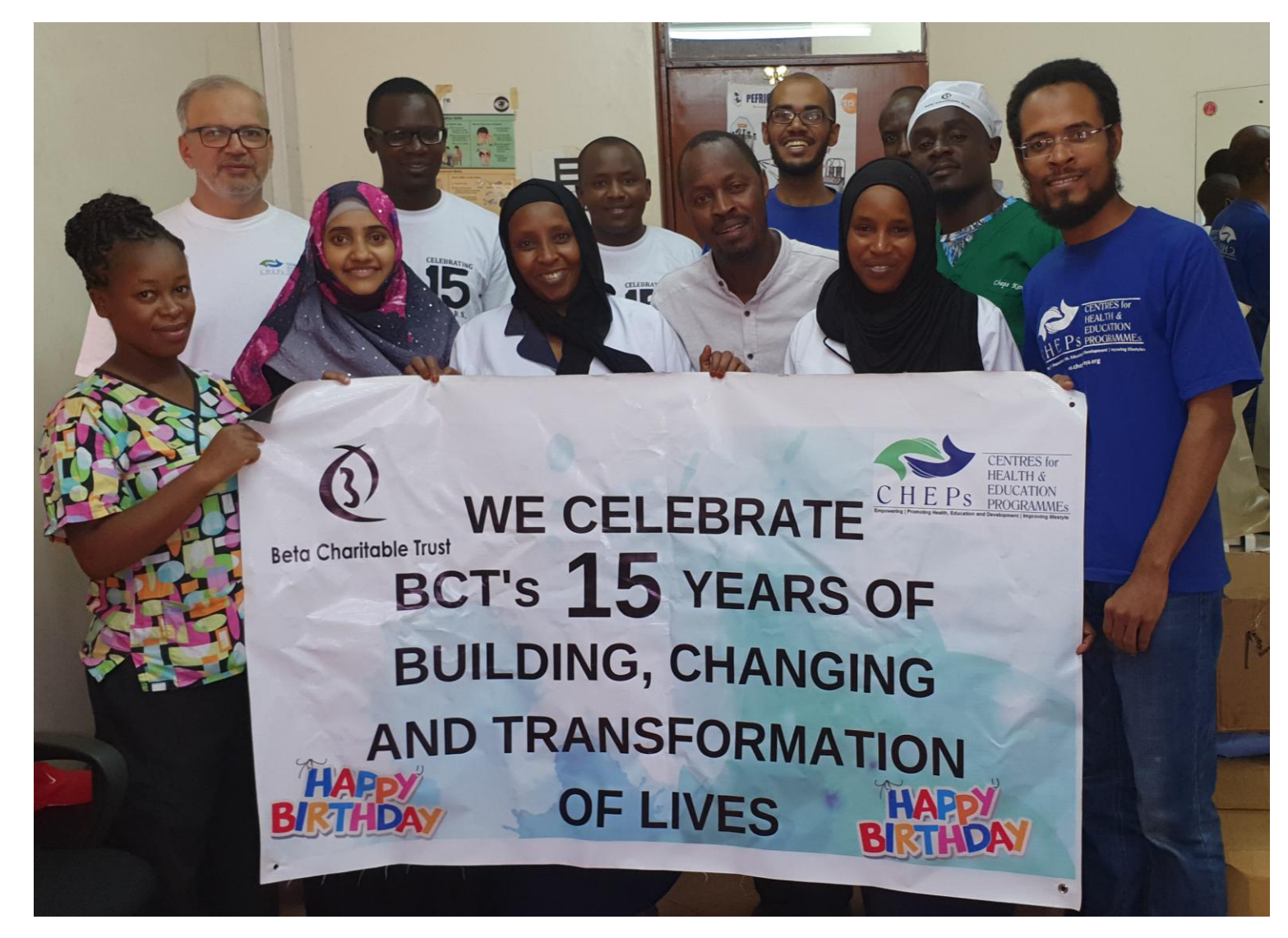
The team that made the camp a success

P. O. Box 23608-00100 Nairobi, Kenya | info@chepskenya.org | www.chepskenya.org