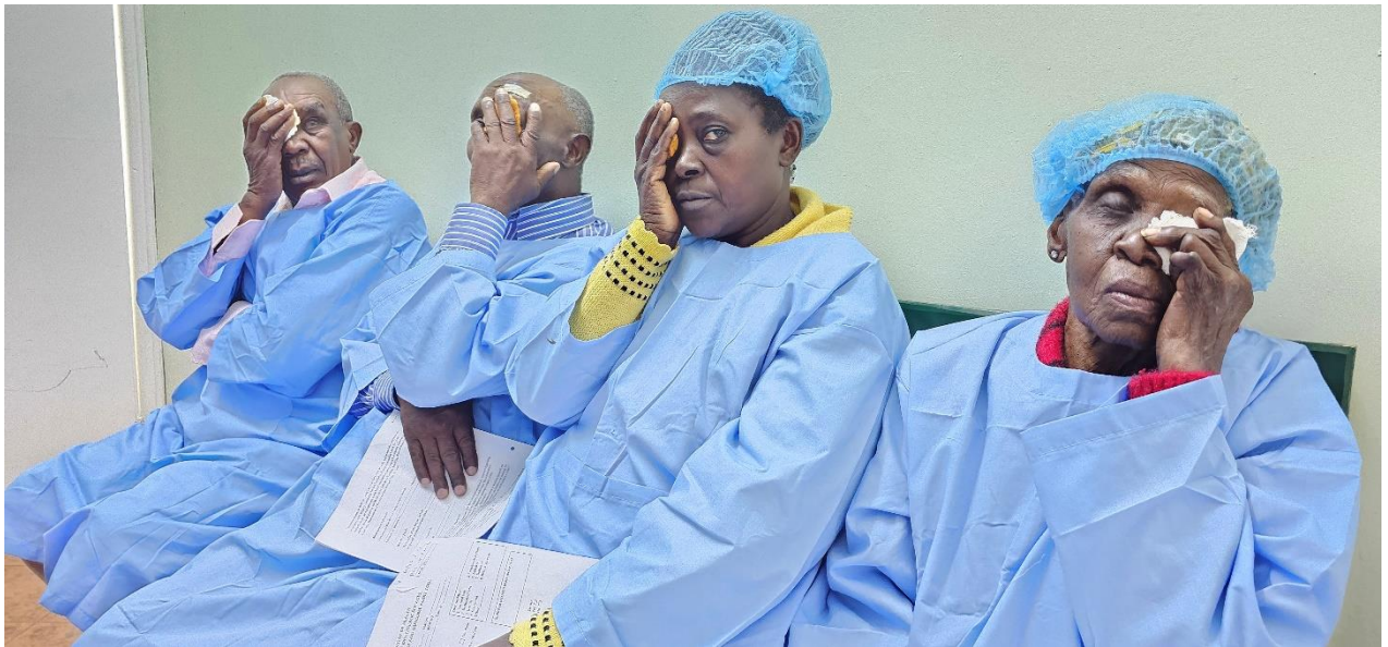
Cataract patients in theatre's lounge