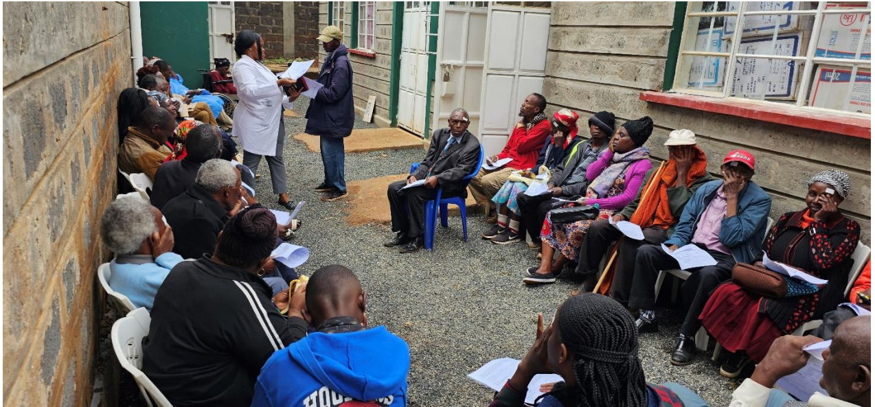
Cataract patients waiting to proceed to theatre