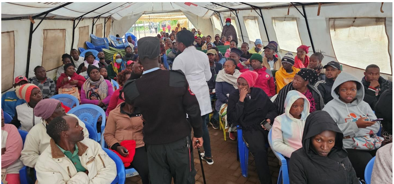
Patients waiting to be served