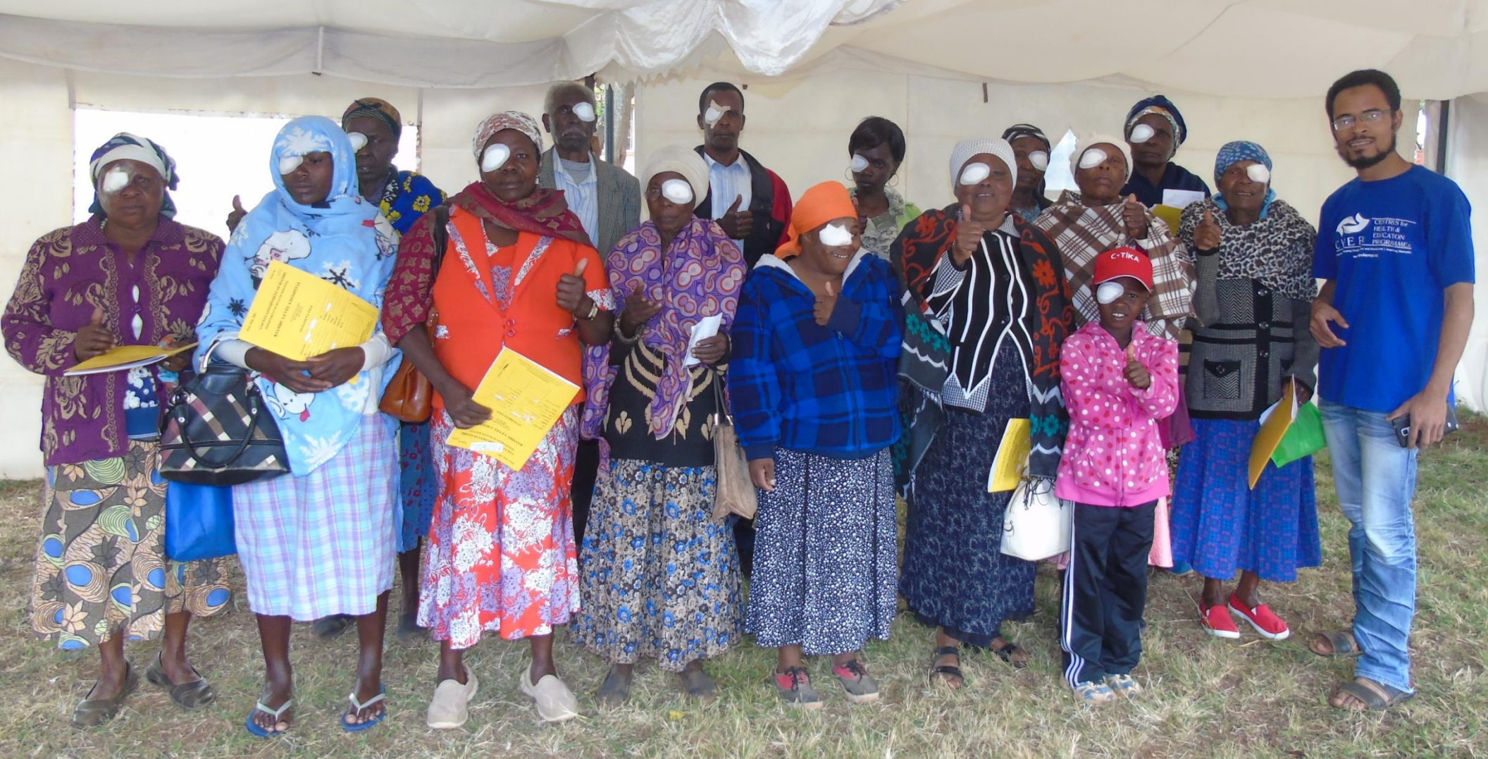
CHEPs 76 th Eye Camp 1 st – 6 th October 2018 Kiambu County, Kenya