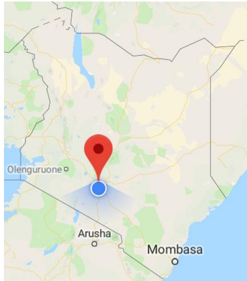
Map of Kenya showing location of Kiambu County