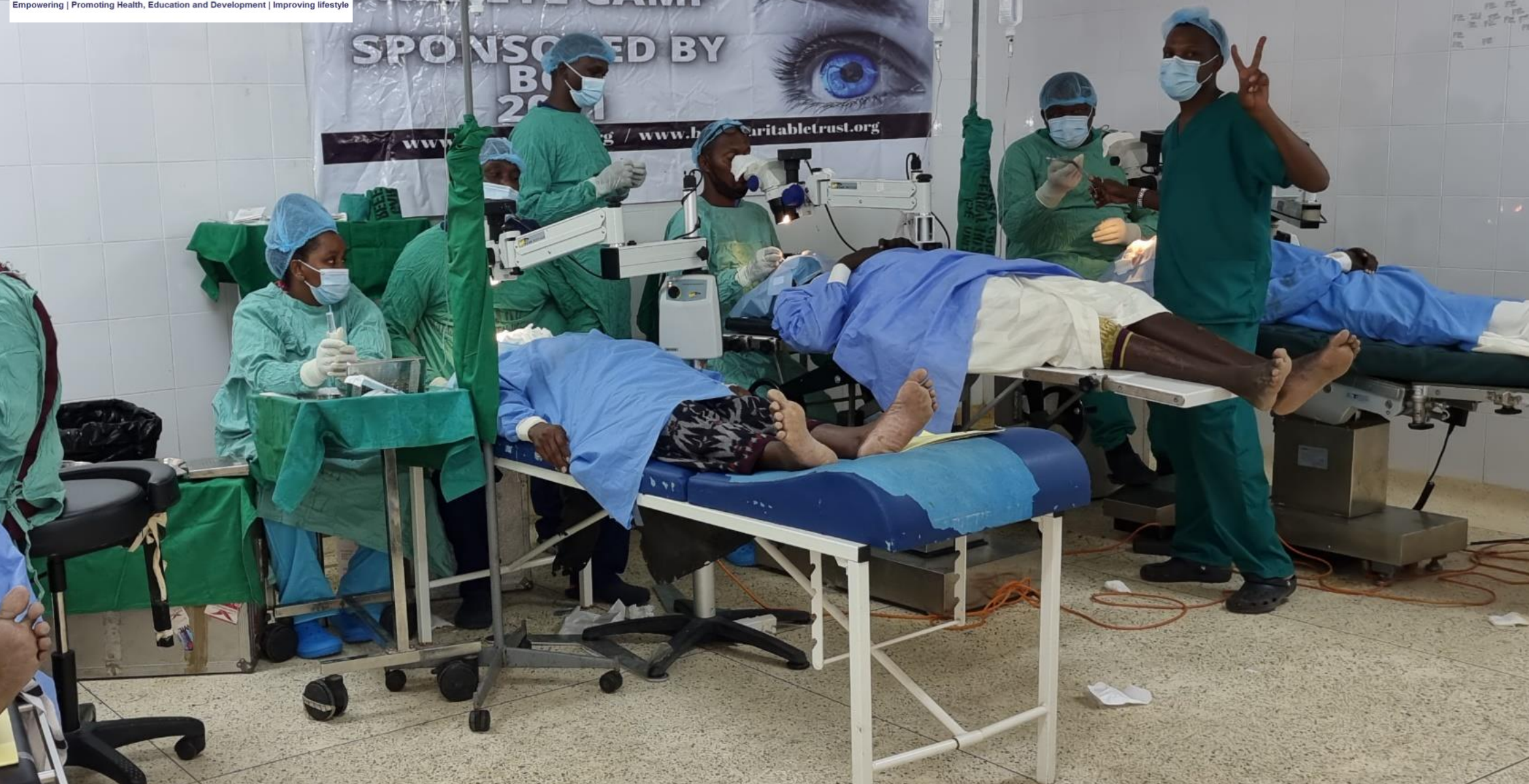
CHEPs 110 TH EYE CAMP GARISSA COUNTY 17 TH TO 19 TH NOVEMBER 2021