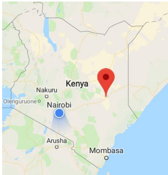
Map showing the location of Garissa