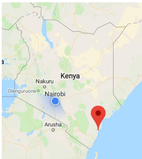
Map of Kenya showing the location of Kilifi County