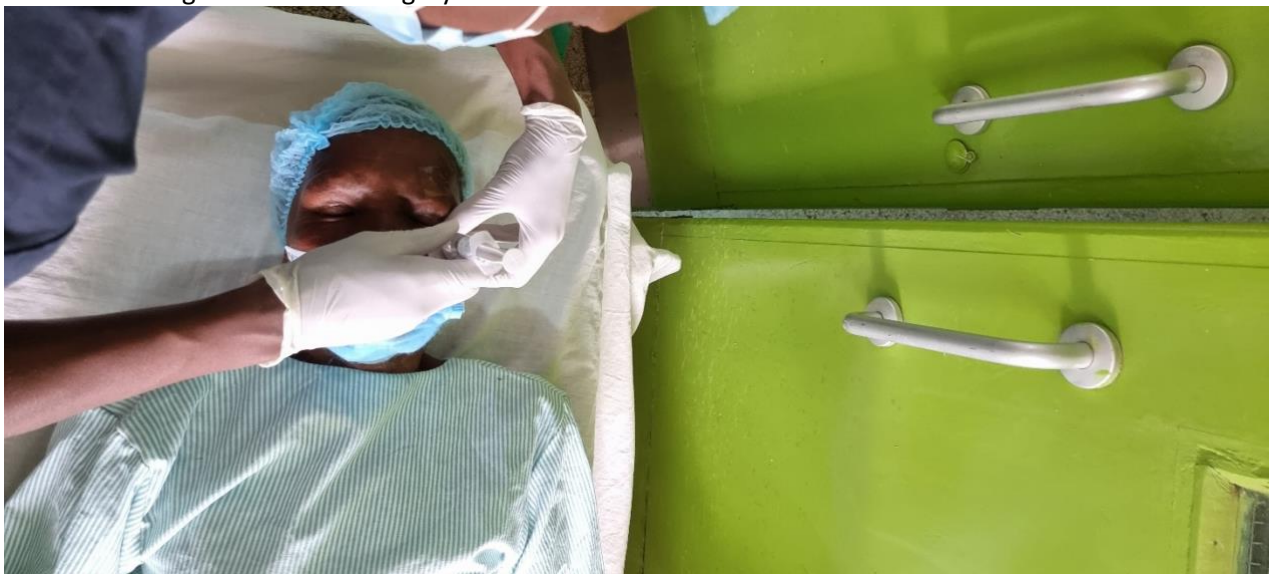
Administering local anaesthesia