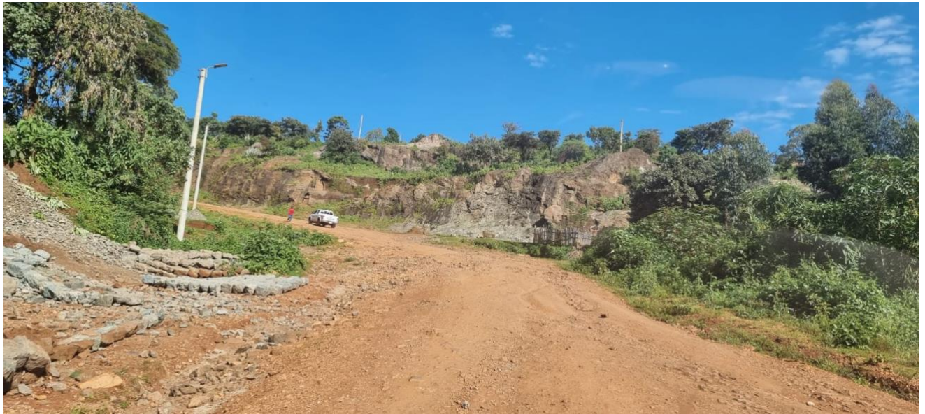
CHEPs travels to remote sites to deliver services to the needy