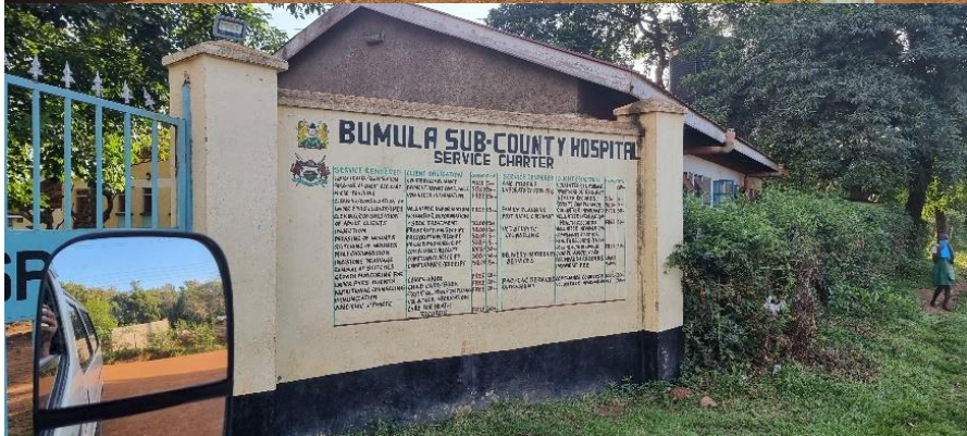
In Bungoma the camp was held at 3 different sites on consecutive days: Bumula subcounty Hospital, Mount Elgon subcounty hospital and Webuye county Hospital all located in different parts of the County