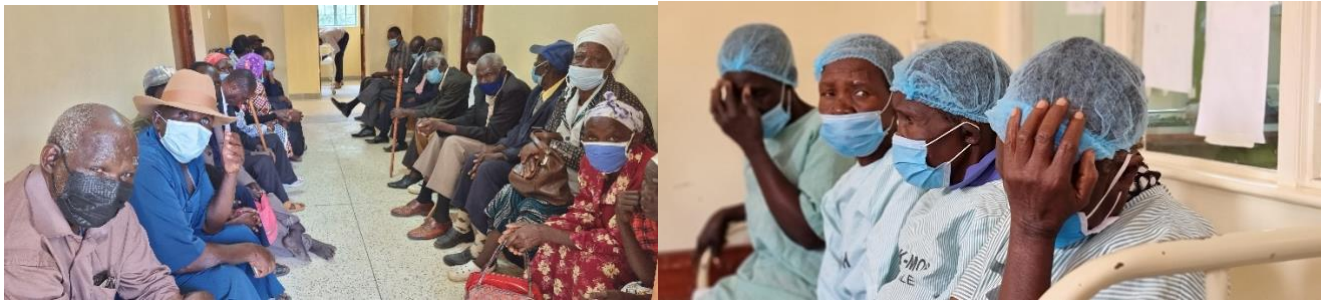
Patients waiting their turn for surgery