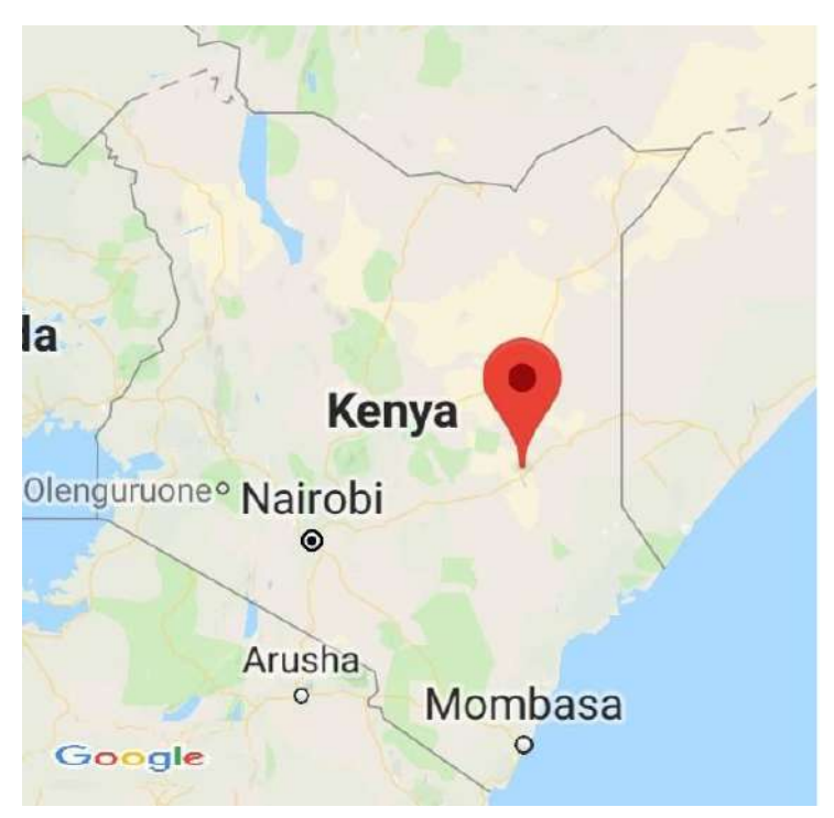
Map of Kenya showing the location of Garissa