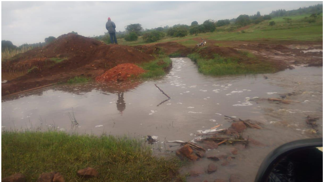
Flash floods on the day of the camp