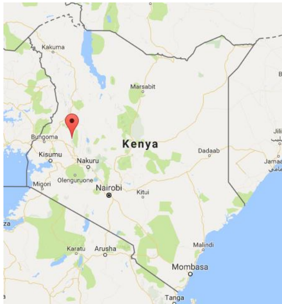
Map showing the location of Elgeyo Marakwet