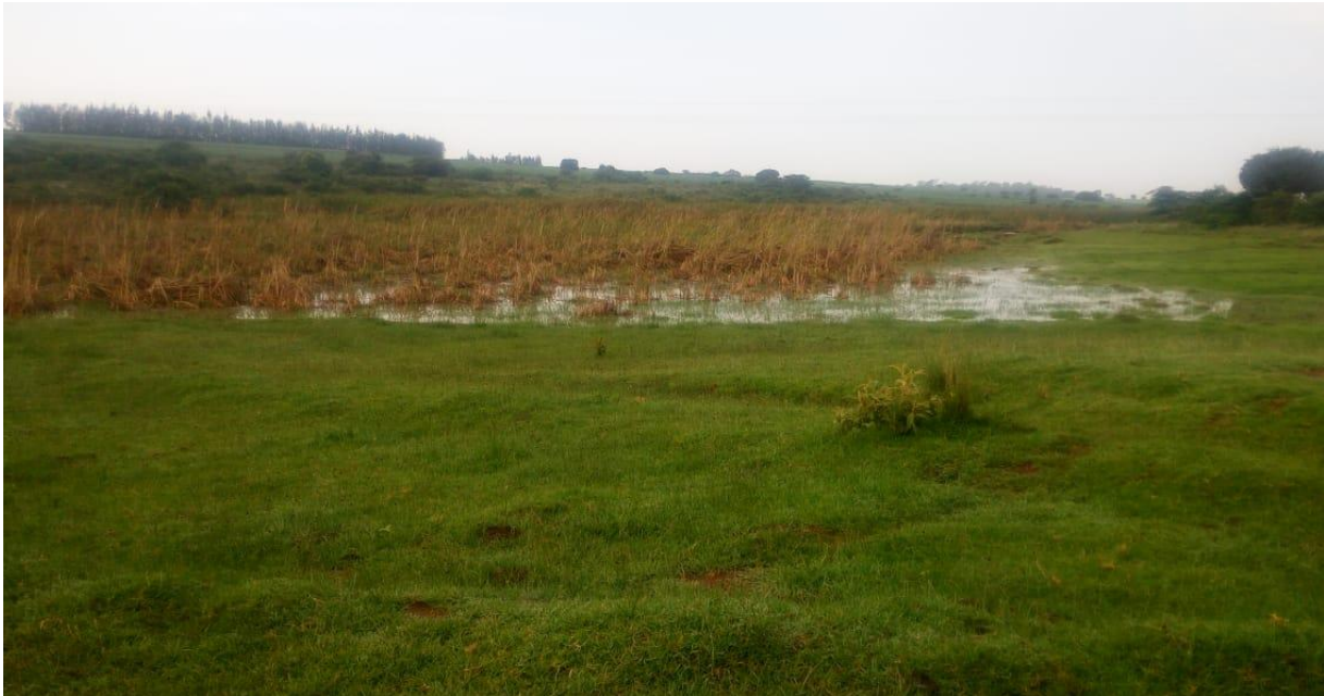
Flash floods on the day of the camp